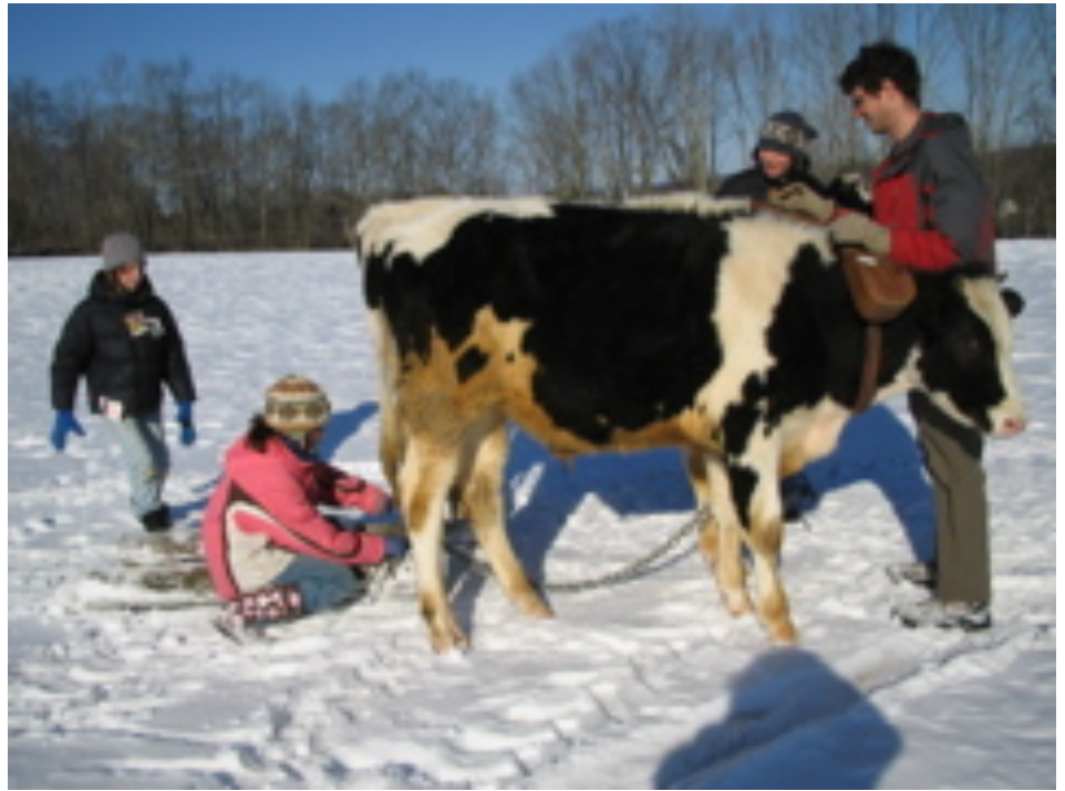
For more great photos of the Farm School trip, see page 3

Everyone is Different. Everyone Belongs.